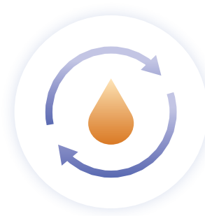
Excess protein in the urine