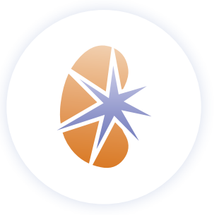
Reduced glomerular filtration rate (reduces ability of the kidney to filter the blood and make urine)